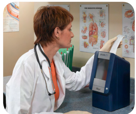
Step 3: Read results