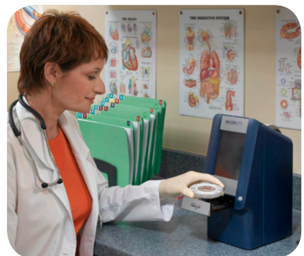
Step 2: Insert disc