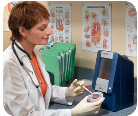
Step 1: Add sample - 0.1 cc