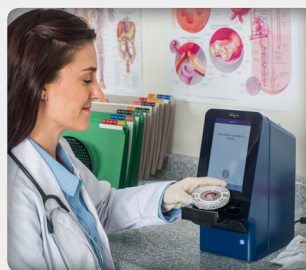
2 / Insert disc