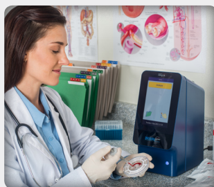
1 / Add sample

From sample to complete panel results in 3 simple steps and approximately 12 minutes