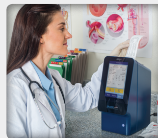
3 / Read results